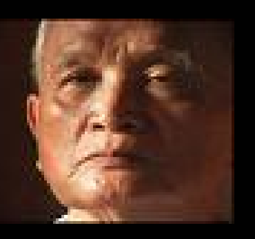
Nuon Chea, 'brother number 2'