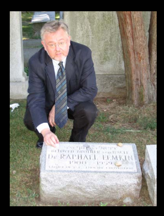
Lemkin's grave in New York City